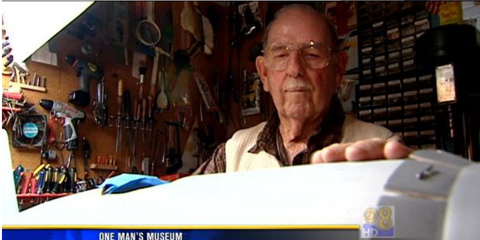
ONE MAN'S MUSEUM