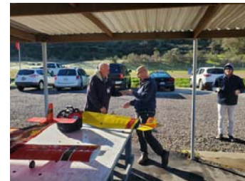
Lyle Black Award